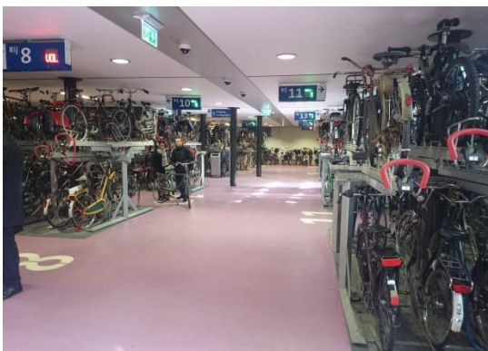
In Utrecht about 60% of the residents travel by bicycle