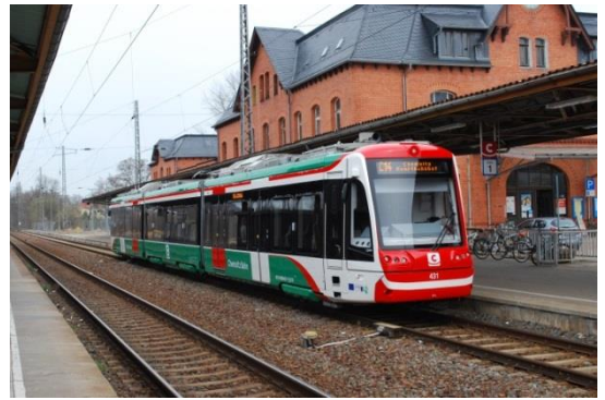
Commissioning of the new vehicles on the Chemnitz-Mittweida route

With a subsidy from the European Regional Development Fund (ERDF) eight new hybrid tram/trains, which can run on both tram and railway tracks, are being purchased. Of the total costs of €42.8 million the ERDF provided the major share, €32 million. The Transport Association of Central Saxony (VMS) acquired these tram/trains for the routes of Stage 1 of the Chemnitzer Modell, which will connect the surrounding railway network with the Chemnitz tram network and make it possible to link the towns Burgstädt, Mittweida and Hainichen with the city centre of Chemnitz. The Chemnitzer Modell was launched in 2002 on the pilot route from Chemnitz to Stollberg, and after the passenger numbers had developed satisfactorily, it has been successively extended and developed in order to steadily improve the links between the surrounding area and the City of Chemnitz. So now the first construction work for Stage 2 of the Chemnitzer Modell has started to open the link to the university campus and the future connection to the town of Thalheim.