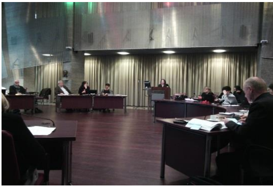
The Culture forum has invited its member to join in