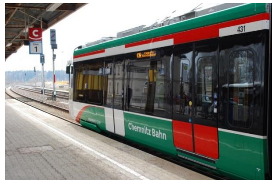
Dual-system "Citylink Chemnitz" vehicles manufactured by Vossloh