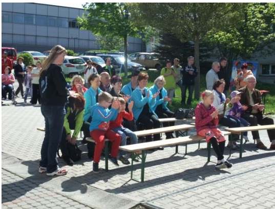
May 4th is the European Day of Cultural, Youth Work and the Creative Industries