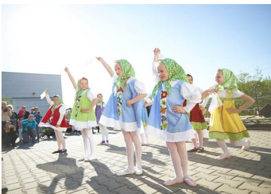
The Kolorit Club is taking part in the Festival of Neighbours again in 2016